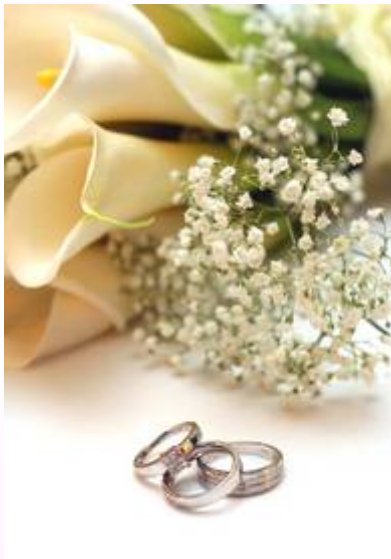
C. PR Wedding Photography

We will manage your day from the very beginning through to your evening entertainment ensuring that any problems that may arise are managed effortlessly without any disruption to your perfect day.