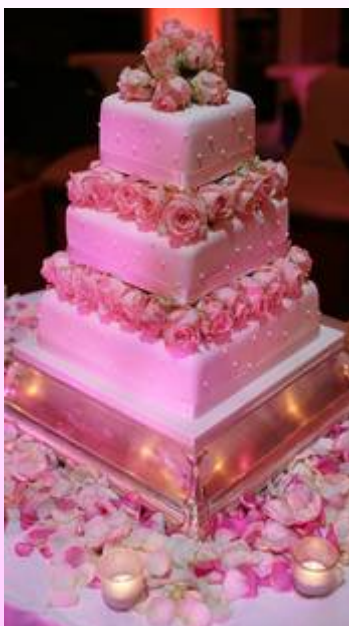
C. PR Wedding Photography

Please contact us on 07930 482972 for a no obligation chat about any of our services.