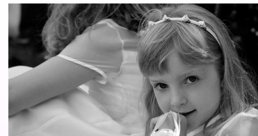
C. PR Wedding Photgarphy

We will be more than happy to discuss your needs and agree areas of responsibility with you at our initial consultation meeting. We then prepare a quote tailored specifically to you and what you want. The price is fixed and is not based on a percentage of your final budget.